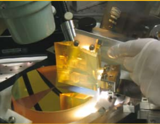
Precision alignment: Positioning the first wedge of a cube corner.