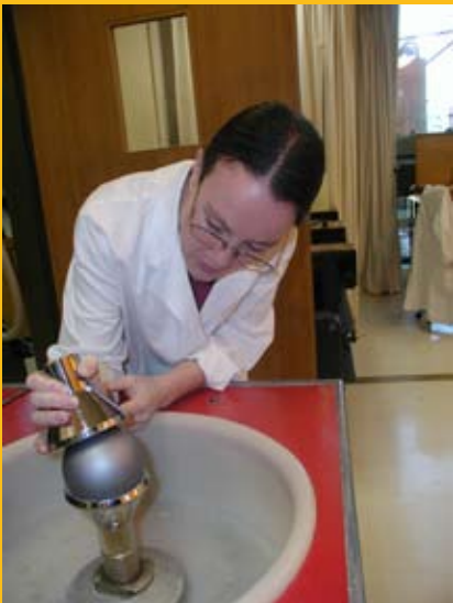
Precision sphere: For new mass standard and redetermination of Avogadro's constant.

Visit www.acpo.csiro.au or our facility in the Sydney suburb of Lindfield.