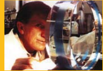
Ultra-flat and super smooth: Examining an End Test Mass for gravity waves.